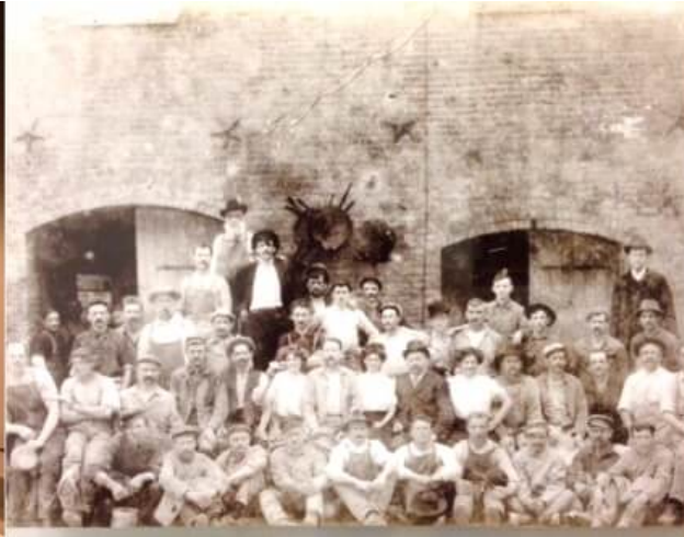
Brooklyn Employees in 1904