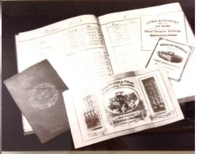
Price List 1902